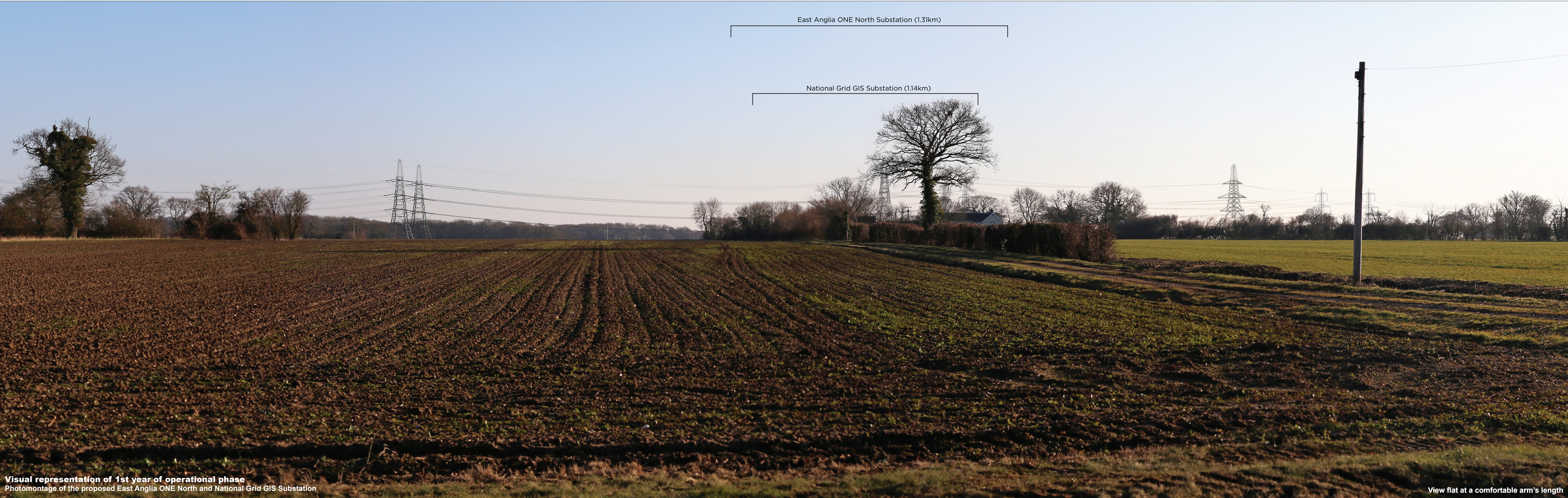
Visual representation of 1st year of operational phase Photomontage of the proposed East Anglia ONE North and National Grid GIS Substation