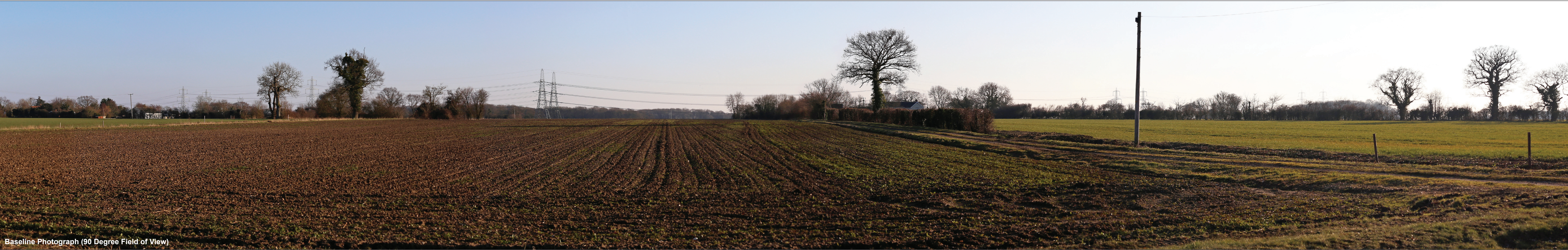
Baseline Photograph (90 Degree Field of View)