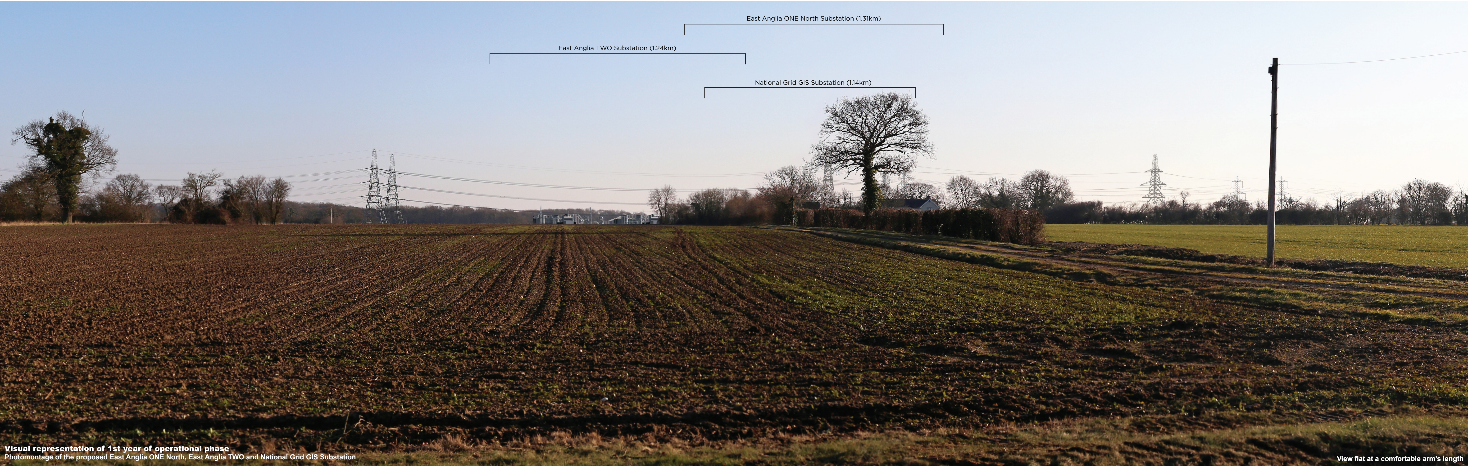
Visual representation of 1st year of operational phase Photomontage of the proposed East Anglia ONE North, East Anglia TWO and National Grid GIS Substation